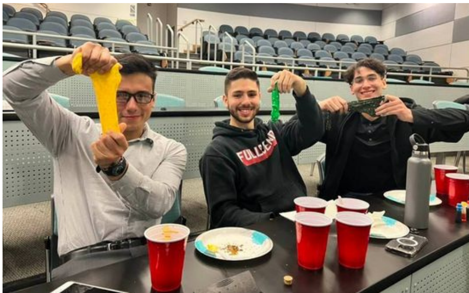
Making slime at Univeristy at Buffalo SASP GBM!

Being elected as a new board member or into a new role can be nerve-wracking. Providing a reference document with information about their roles and expectations can help chapter leaders gain an understanding of the value of their role, and formulate any questions they have about their role. The materials provided should be straightforward and concise, including the responsibilities of the position, and a list of meetings and events to attend. Checklists can also be very