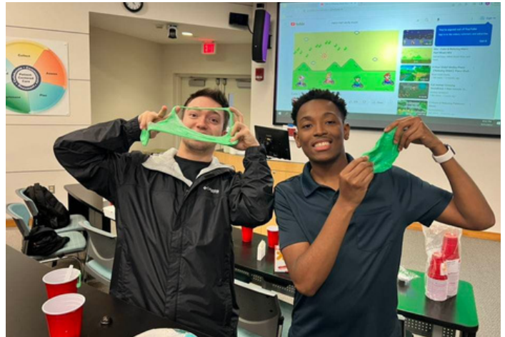
Showing off the slime they made at their GBM