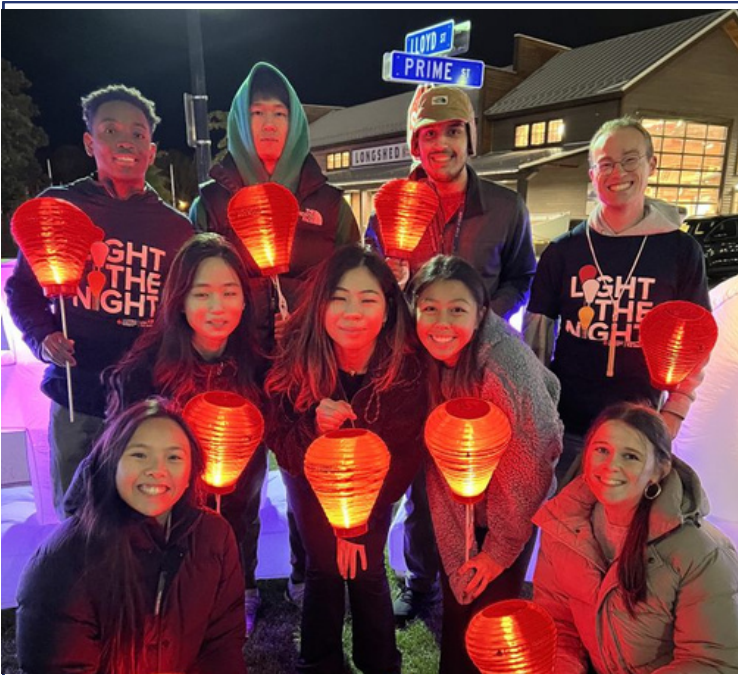
Light the Night Walk Fundraiser for Leukemia and Lymphoma Society