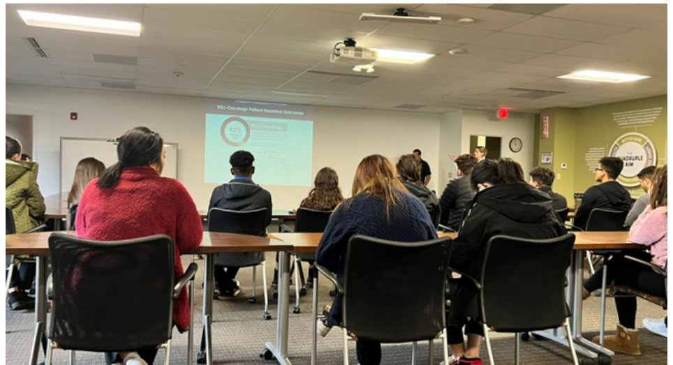
Top image: UB SASP students went on a tour in RelianceRx where they saw behind the scenes and learned the operations of a specialty pharmacy